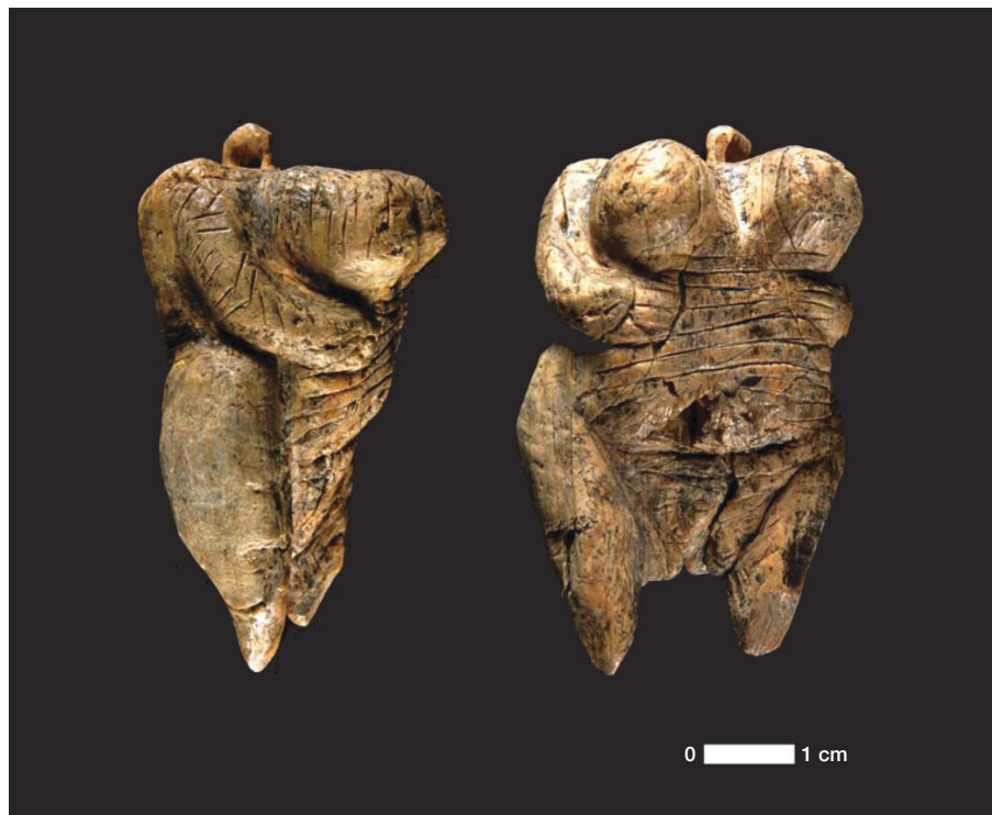
Figure 1 | Side and front views of the Venus of Hohle Fels.

The figurine originates from a red-brown, clayey silt at the base of ~1 m of Aurignacian deposits. One fragment was attributed to feature 10, a small area rich in charcoal at the base of archaeological