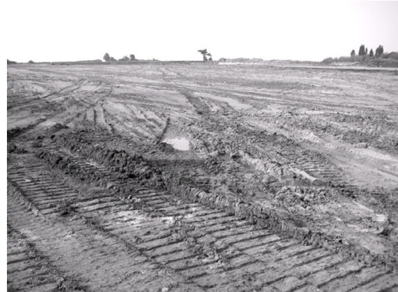
EXCAVATION HYLLIE, MALMÖ, 2004

that made it possible to resist the principle of public access to official records. The ERA report was followed by suggestions and design programs made by two other American Companies, the BRC Imagination Arts, and Jack Rouse Associates. Enough have been published about this in the daily press, and on the home page of BRC, to suggest that there are a number of types of Americanness to be awaited here.