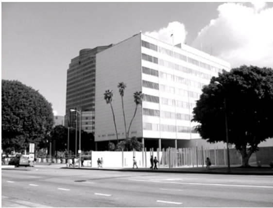
POLICE HQ LOS ANGELES, 2004

First, let's consider the two main offices of the police forces in LA and in Malmö, respectively. Both of them are currently (and constantly) in a process of reconstruction on the basis of security. [12] The police headquarters in both Malmö and Los Angeles are quite «neutral» buildings, somewhat office-like, but they do bear traces of police-specificity, stemming from, for instance, the increasing demand to navigate radio communication, the need to be able to keep people locked inside the building for different periods of time (ranging from minutes to approximately a year), the politics of how to approach a prisoner, etc. The rather open and neutral character of the exterior of these two buildings hides interior activities derived from a strictly regulated social grammar, some rules of which require specific design. [13]