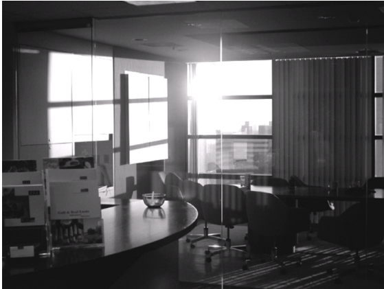
ECONOMIC RESEARCH ASS., MAIN OFFICE, L A, 2004