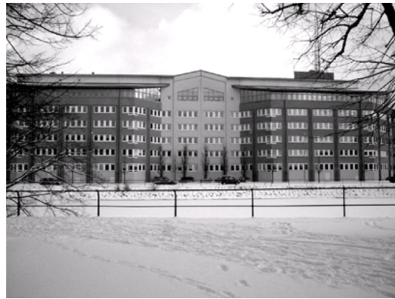
POLICE HQ MALMÖ, 2004

[12] When it comes to issues of security, the flow of ideas seems to go from USA to Sweden — the opposite direction would be almost unthinkable, since Sweden is often considered as a rather naive nation as far as security issues are handled. This presumed naiveté is, in comparison, perhaps not only a rumour, but could hypothetically be a consequence of the fact that the nation has not been fatally involved in severe conflicts for more than a century. (During WW2, for instance, the Swedish government maintained a dubious balancing act to avoid conflict, when closing a treaty with Germany admitting a transportation of arms through Swedish territory). More recently, there has been an increasing concern with security policies — beginning with the murder of the Prime Minister Olof Palme in 1986, but more intensely so in connection with the violent confrontation between police and activists in connection with a G8 meeting in Gothenburg 2001, as well as with the murder of foreign minister Anna Lindh in 2003. In the aftermath of the Gothenburg riots, the trial of the commanding chief officer of the Gothenburg Police Force was held, during which, among other accusations (of an insufficiently organised response), it was indirectly suggested that his over-reaction against large groups of peacefully demonstrating young people was due to the pressure on him occasioned by the visit to Gothenburg of George W Bush.